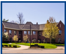
New 99 Room Multi-Level Senior Living Facility