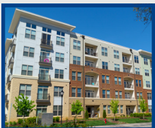
Premium 564 Unit Off-Campus Housing