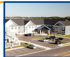
New 101 Room Multi-Level Senior Living Facility